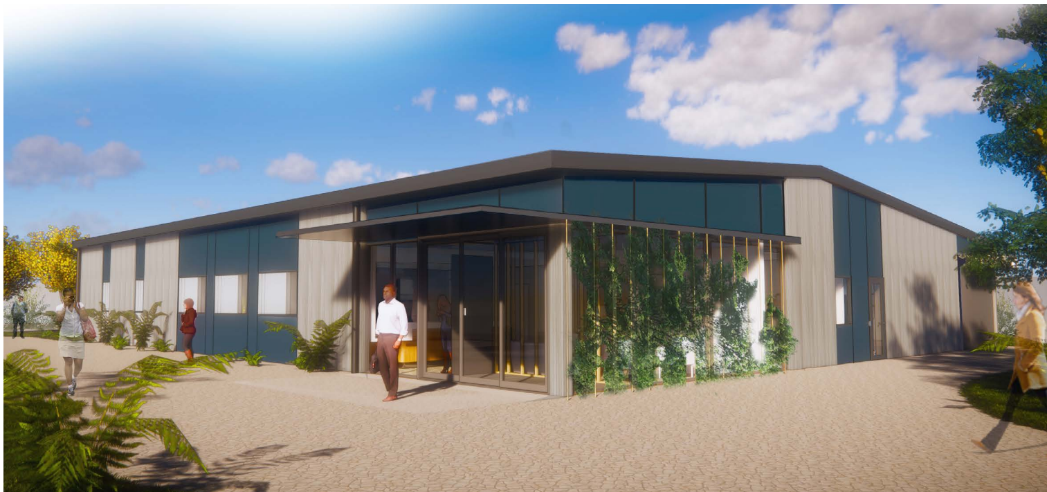
Artist impression of the Kererū Kidney Centre.