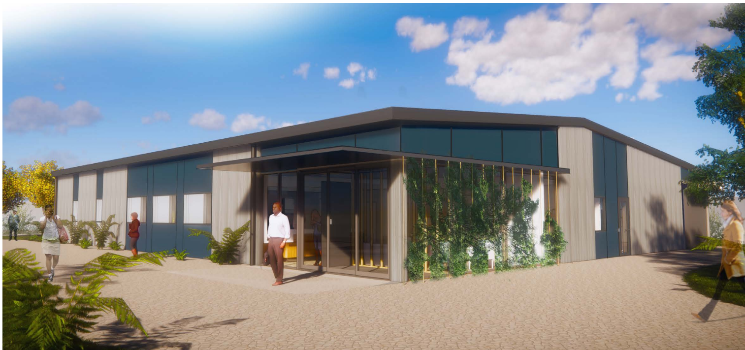
Artist impression of the Kereru Kidney Centre.