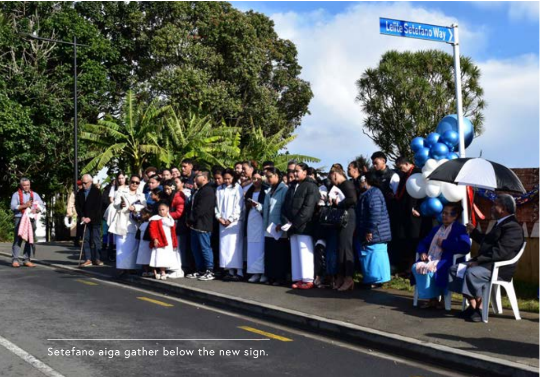
Setefano aiga gather below the new sign.

He leaves behind a wonderful legacy and will forever be remembered for his love for the people of Tāmaki and his decades of service to the community.