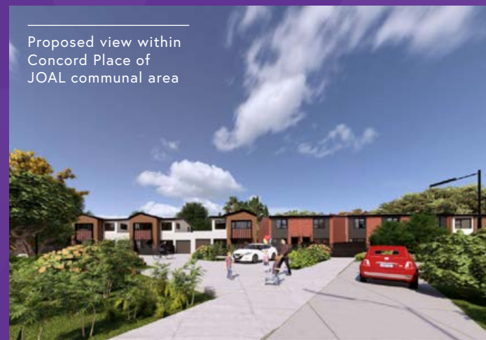
Proposed view within Concord Place of JOAL communal area