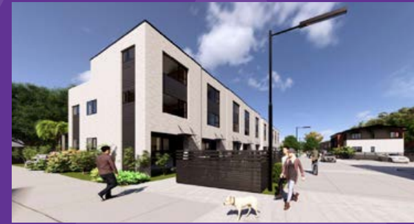
Proposed view into Concord Place from within the new JOAL (jointly owned access lot)

If you have been wondering about the progress of the project, see below for a list of frequently asked questions. Alternatively, you can visit the Concord Social Pinpoint link at trc.mysocialpinpoint.com/concord-glen-innes to leave feedback.