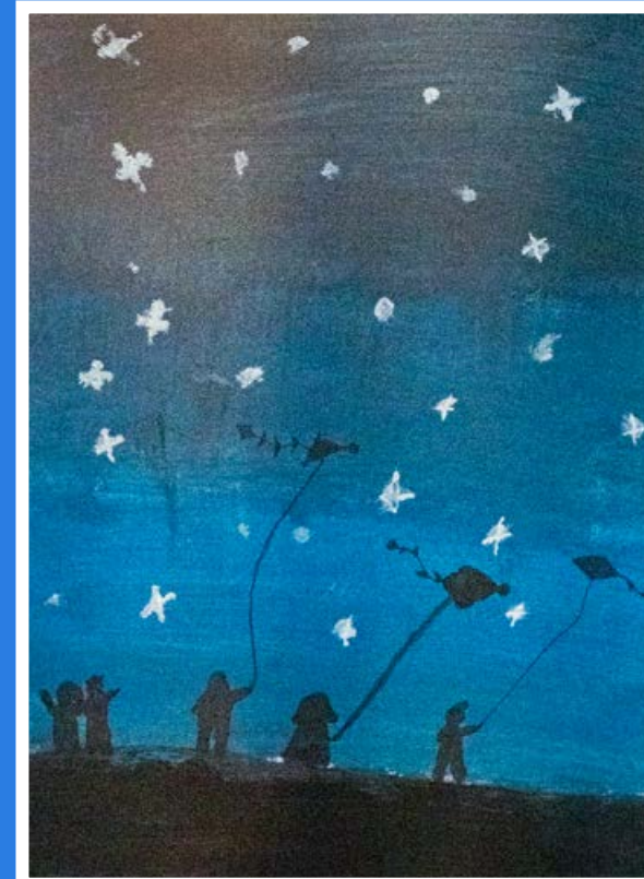
Artwork by Tumannako Rakai.

To view the online book, visit www.cometauckland.org.nz/our-campaigns/current-campaigns/education-m%C4%81ori