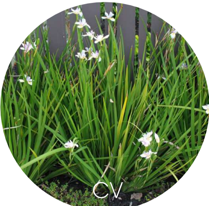
Dietes grandiflora Wild iris