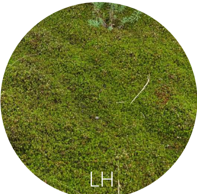
Muehlenbeckia axillaris Pohuehue