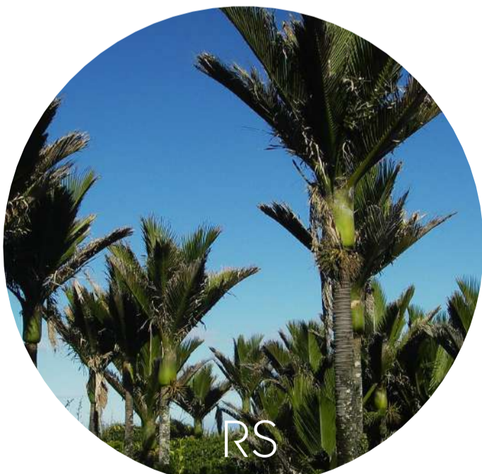
Rhopalostylis sapida Nikau