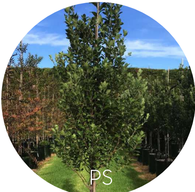
Pittosporum 'Stephens Island' Cook Strait pittosporum