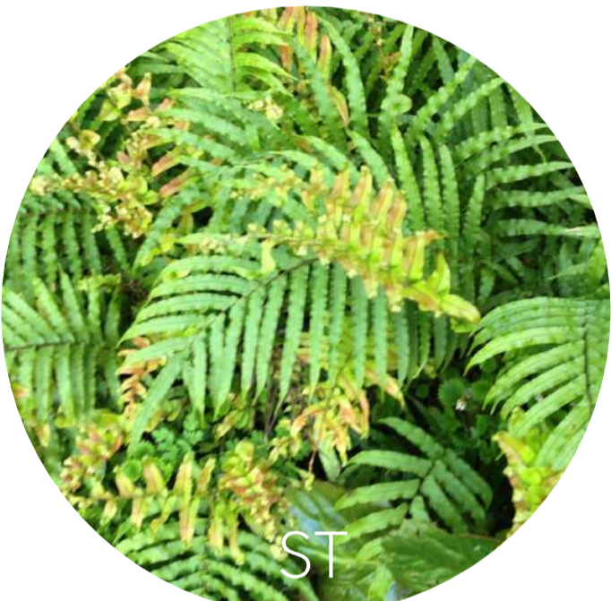
Blechnum novae-zelandiae Kiokio