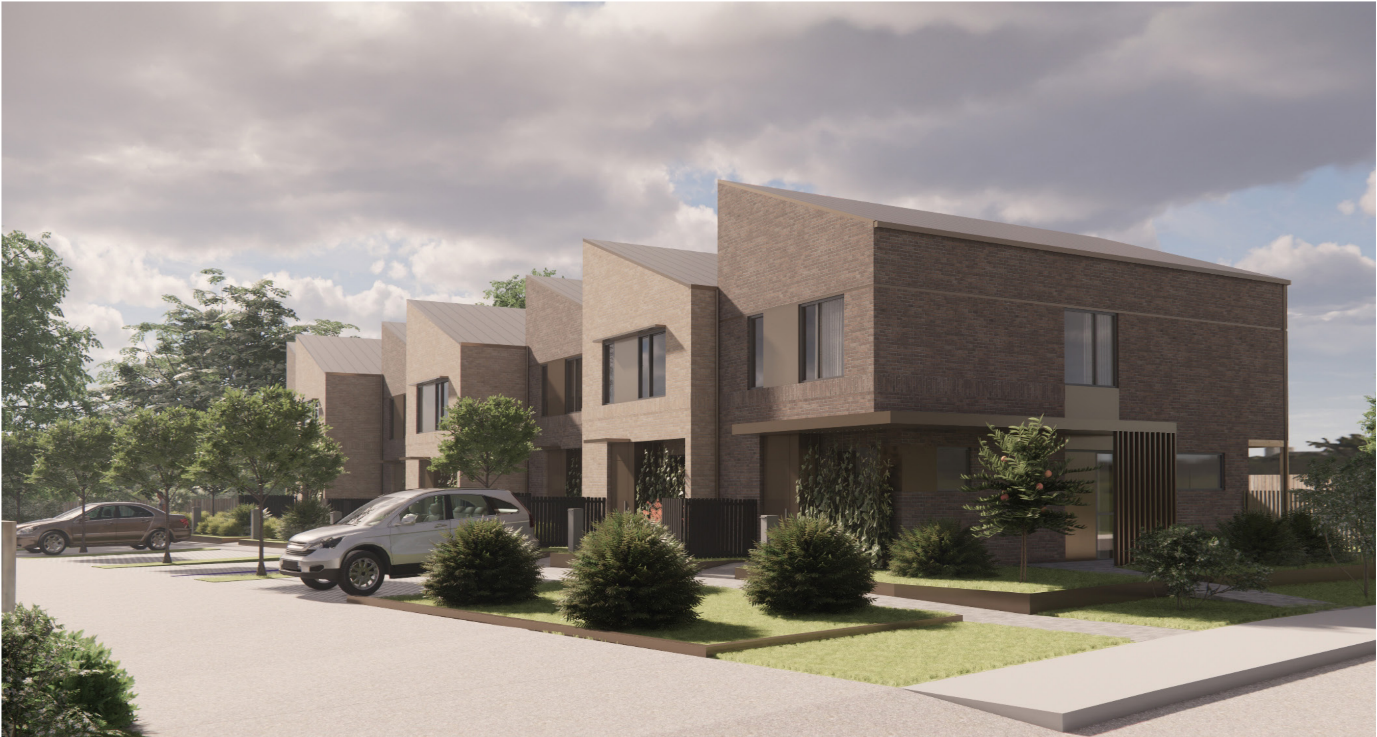
View South-West from Larsen Road