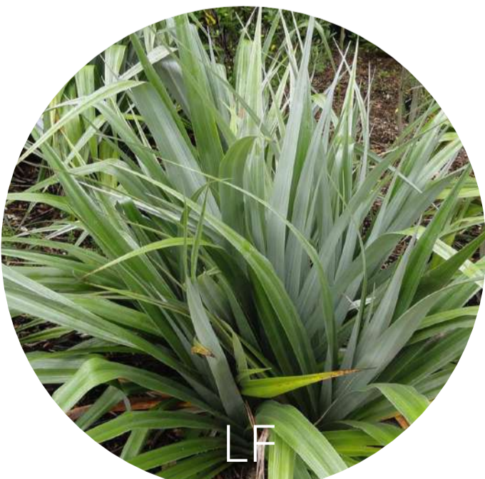
Astella chathamica 'Silver Spear' Chatham Island astelia