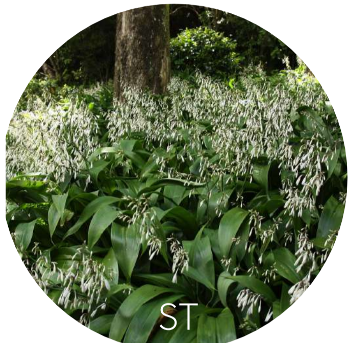
Arthoropodium cirratum Rengarenga