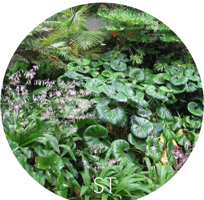
Ligularia reniformis Tractor seat