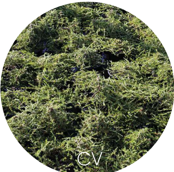
Coprosma 'Hawera' Coprosma hawera