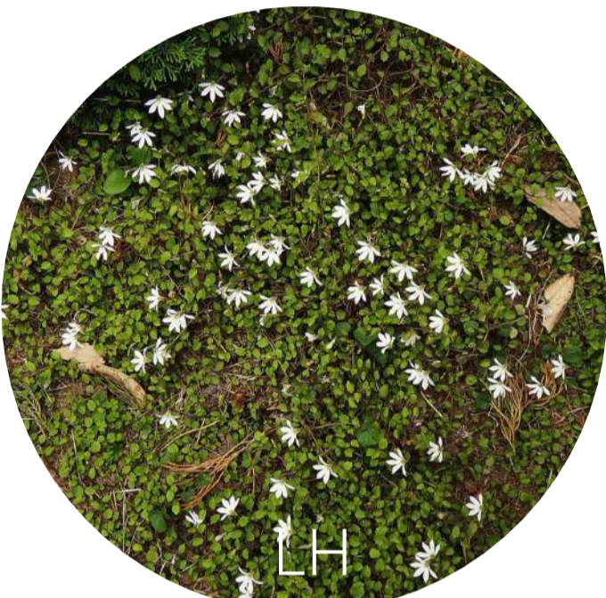
Lobelia angulata Panakenake