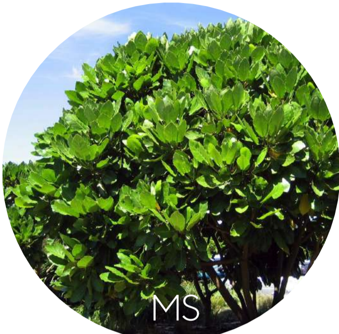
Meryta sinclairii Puka – crown lifting maintains visibility across the site below the canopy