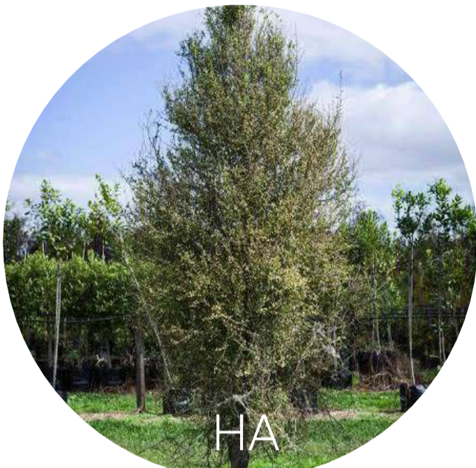
Hoheria angustifolia Hungere – columnar growth habit allows vertical softening to street