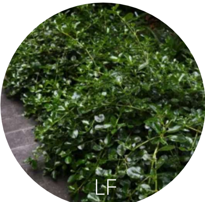
Coprosma repens 'Poor Knights' Taupata