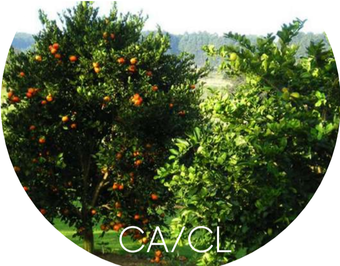
Citrus aurantifolia/limon Lemon and lime trees